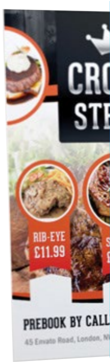
4 Table Talkers

DO NOT ALLOW YOURSELF TO COMPROMISE. QUALITY GUARANTEES THE BEST EXPERIENCE.