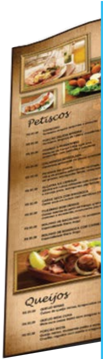
6 Resturant menus