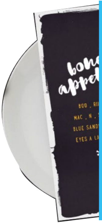
8 Tent cards