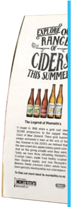
10 Drink Lists